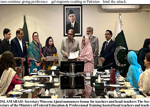
Complaint lodge against judge after police