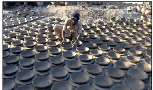
HYDERABAD: Craftsmen preparing clay made pots at his workplace.