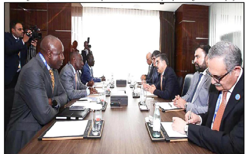
BEIJING: Caretaker Prime Minister Anwaar-ul-Haq Kakar meets President of Kenya Dr. William Ruto on the sidelines of 3rd Belt and Road Forum being held in Beijing.