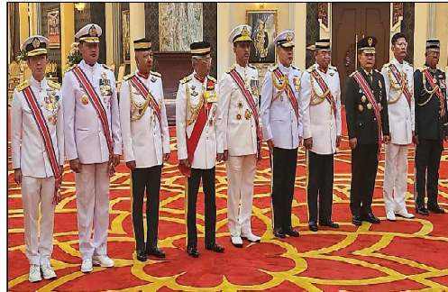
KUALA LUMPUR: Pakistan Navy's former Chief of the Naval Staff, Admiral Muhammad Amjad Khan Niazi along with other recipients of award from different countries at Kuala Lumpur, Malaysia.

struggle in Balochistan in various ways, they observed. Blocking the political process will benefit those forces who are not well-wishers of Balochistan, the lawyers' leader stated. They mentioned that the registration of such baseless FIRs against political leadership is not a good practice as the consequences of stopping the political process are not positive but negative. Such actions will only increase hatred, they concluded.