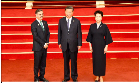
BEIJING: Chinese President Xi Jinping and First Lady, Madame Peng Liyuan welcomed Caretaker Prime Minister Anwaar-ul-Haq Kakar upon his arrival at Great Hall of the People to attend the banquet hosted by President Xi Jinping in honor of the leaders of the countries participating in the 3rd Belt and Road Forum, Beijing.