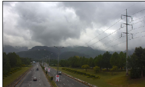
ISLAMABAD: A beautiful and eye catching view of clouds hovering on the sky of capital city.

United Nations Security Council, the resolution presented by Russia could not be passed as it aimed to stop the war between Palestine and Israel on the humanitarian grounds. He said it was a good omen that Russia and China were standing by the stance of Muslim countries on the issue of Palestine. He further said the United States (US) President Joe Biden was making an extraordinary wartime visit to Israel this week as he sought to demonstrate staunch support for the country. Beside other Muslim leadership, he appreciated the Saudi Crown Prince Mohammed bin Salman for demanding to stop the Israel's aggression on Palestine in his recent meeting with US Secretary of State Antony Blinken.