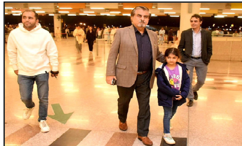
ISLAMABAD: Caretaker Federal Minister for National Heritage and Culture Jamal Shah on Oct 18, 2023 departed for Korea to represent Pakistan in Migrant Multicultural Festival to be held from Oct 20 to 22, 2023.

Israel has launched a wave of arrests and raids in the occupied West Bank since 7 October, when 1,300 Israelis were killed by Hamas gunmen. Around 61 people have been killed and 700 detained in the West Bank, including 200 suspected members of Hamas. Israeli retaliatory strikes on Gaza have killed at least 2,800 Palestinians, including over a thousand children.