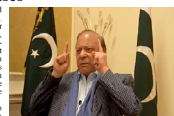
that the watchdog would give its arguments when the appeal would be fixed before the court.