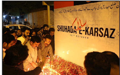
HYDERABAD : Workers of PPP candle light for the martyrs of Karsaz tragedy.

Gaza. The Democratic president deliberated carefully before accepting the invitation to visit right-in-winger Netanyahu, who has ordered the preparations for what is expected to be a bloody ground offensive against Hamas in Gaza.