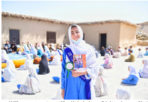
over 15,000 government-run primary, middle and high schools across Balochistan. As per a confidential report obtained by Daily Quetta Voice, still over 2 million children are out of school.

The literacy rate in Balochistan is 46 percent as per statistics obtained from the education department with 61 percent male and 29 percent female. The province has not conducted any survey to assess the learning quality of students studying in