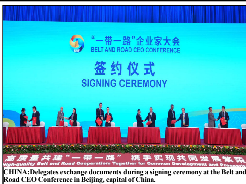
CHINA: Delegates exchange documents during a signing ceremony at the Belt and Road CEO Conference in Beijing, capital of China.

both countries attended this ceremony. Since June 2022, heavy monsoon rains have intermittently caused flooding that has submerged one-third of the country, resulting in more than 1,700 deaths and 33 million people affected. Damage in Sindh province has been severe, accounting for 66% of the total damage in the education sector. As medium- and long-term measures, the rapid reconstruction of damaged educational facilities are important to ensure that children have safe learning opportunities. This is the fourth grant aid through which the Government of Japan supports the improvement of educational facilities in Sindh province. It has been reported that the school buildings assisted by Japan in the past projects suffered less damage and destruction from the rainfall and flooding in 2022 because they were designed and constructed based on analysis of the 2010 floods. The new project will also incorporate the concept of "Build Back Better" to reduce vulnerability of the target schools to future disasters and build resilience of communities where the schools are located. Mr. KINOSHITA, while speaking at the event said "we believe that the new grant aid project will build not only school buildings, but also it will build brighter and more resilient future for the next generation of Pakistan."