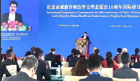
BEIJING: Chairman Senate of Pakistan, Muhammad Sadiq Sanjani on Tuesday delivered a speech at the International Symposium held in Beijing to Commemorate the 10th Anniversary of China's.