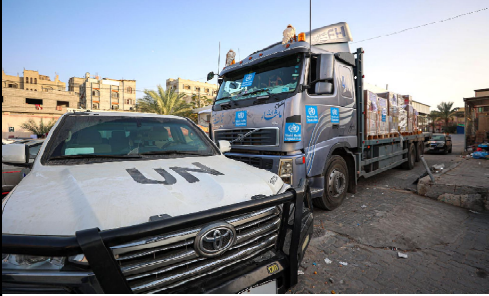
GAZA: A truck loaded with relief supplies can be seen entering Gaza from the Rafah border in the southern city of Khan Yunis in the Gaza Strip.

on November 13. The ECP expressed anguish on the interior secretary's apology and observed that if the department cannot provide security to a single person, how it [ECP] could hold general elections. "How interior ministry can order the ECP" the head of the four-member bench asked. The ministry of interior will not produce the Pakistan Tehreek-e-Insaf chairman before the Election Commission of Pakistan (ECP) due to security reasons. The ministry and Islamabad police have informed the ECP in this regard citing that production of former premier would be a security risk. The ministry issued the apology to the ECP.