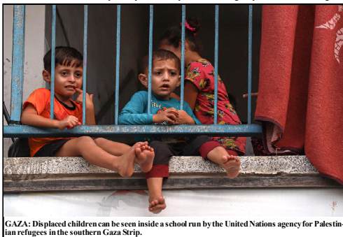
GAZA: Displaced children can be seen inside a school run by the United Nations agency for Palestinian refugees in the southern Gaza Strip.