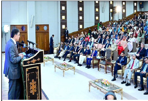
ISLAMABAD: Caretaker Prime Minister Anwaar-ul-Haq Kakar distributes cheques among the families of martyred polio workers and polio workers who got injured in the line of duty.

its capital". "Pakistan believes that the fresh spate of violence in Gaza is the result of unabated repression, continued human rights violations and state-sponsored sacrelige of Al Aqsa mosque. "Continuing this war with terrorism would be naive, taking a narrow and self-serving view of the issue as an isolated attack, obscures brutal oppression spanning decades that has led to this outcome," the ISPR quoted the COAS as saying. NEWS DESK