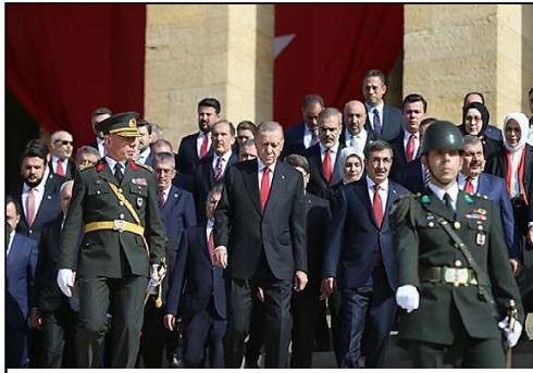
TURKEY: President Tayyab Erdogan is at ataturk mausoleum.

August 15 under the Official Secrets Act. It was registered on the complaint of Home Secretary. Former prime minister Imran Khan and former foreign minister Shah Mahmood Qureshi were nominated in the report, while names of former principal secretary Azam Khan and former planning minister Asad Umar were also mentioned. According to the report, action also will be taken against Azam Khan and Asad Umar after the authorities reached the conclusion that they were also involved in misusing the classified documents. The FIR stated that the former prime minister and foreign minister distorted the facts of the diplomatic cipher. "A conspiracy was launched to misuse the contents of the cipher to fulfill nefarious purposes", it added. It further stated that former premier and top diplomat endangered the state interests.