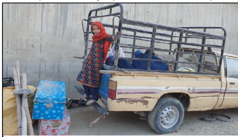
QUETTA: An Afghan refugee girl in Quetta before leaving for Afghanistan.

Cases under the Anti-Narcotics Act have been registered against all the accused while further investigations are under process.