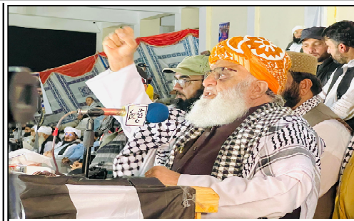
QUETTA: Mulana Fazal-ur-Rehman addressing the large numbers of people gathering at Ayoub Stadium.