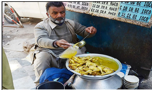
Peshawar: A roadside vendor is selling traditional chicken soup (Yakhni) at Qissa Khwani Bazaar.

"Well, the ICC (International Cricket Council) do change the rules quite a bit with qualification and to be honest I don't think it would affect in any way the way we've played in this tournament so it's not a big deal," said Mott.