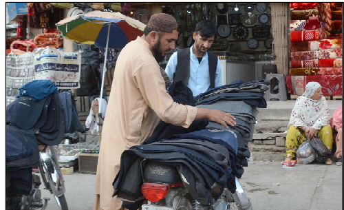
QUETTA: A roadside vendor arranging and displaying used Blazers for selling purposes at Mizan Chowk.

turing of 3,178 tractors in the same month of last year. It was worth mentioning here that the output of the Large Scale Manufacturing Industry (LSMI) increased by 2.52 percent for August 2023 and 8.44 percent when compared with July 2023. The QIM estimated for July-August, 2023-24 is 112.44, whereas overall LSMI has shown a growth of 0.50 percent during July-August 2023-24 when compared with the same period of last year.