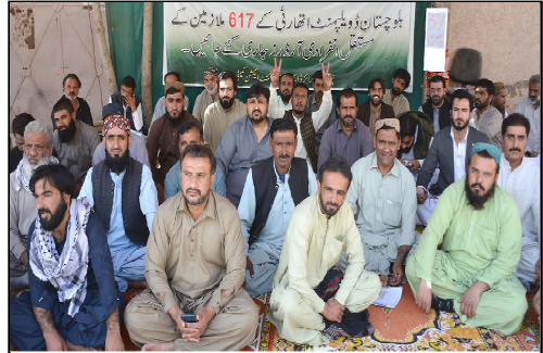
QUETTA: Employees of Newly Regularized Employees Join Action Committee BDA's is still sitting on the 57th day of the protest camp.

one in Islamabad in this phase. "The Mobile Registration service is likely to be operational by November to facilitate the registration process of the beneficiaries residing in the far-off areas of the country", the Secretary BISP said. It is pertinent to mention here that the BISP identifies the deserving beneficiaries through NSER and enrol them in the programme while it is for the first time in the country's history that people with special abilities and Transgender have been included in the programme and can register.