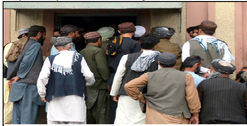
QUETTA: Afghan national gathering outside Afghan consulate.

As per the notification, owing to the decreasing trend of petroleum prices in the international market and due to the appreciation of the Pak Rupee against the US dollar, the government decided to revise the existing consumer prices of petroleum products.