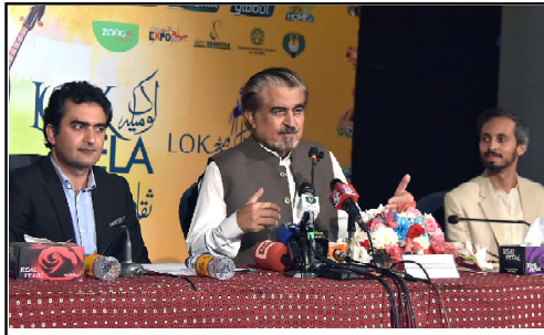
ISLAMABAD: Caretaker Federal Minister of National Heritage and Culture Jamal Shah Speaks during a press conference regarding upcoming Lok Mela at Lok Virsa.

More recently, after the Taliban regained power in 2021, Pakistani officials say between 600,000 to 800,000 Afghans migrated to Pakistan. The Pakistani government claims nearly 1.7 million of those Afghans are undocumented.