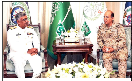
SAUDI ARABIA: Chief of the Naval Staff Admiral Naveed Ashraf exchange views with Commander Royal Saudi Naval Forces Vice Admiral Fahd Bin Abdullah al-Ghufaly at Royal Saudi Naval Forces (RSNF) Headquarters during an official visit to Saudi Arabia.

Back in November 08, 2017, Tehreek-e-Labbaik Pakistan (TLP) organized a sit-in at Faizabad interchange against the amendments in the Election Bill 2017, changing the word oath to declaration. The protesters demanded the resignation of Minister for Law and Justice Zahid Hamid to "protect the identity of the country".