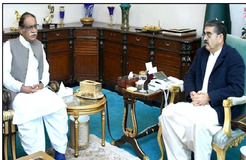
ISLAMABAD: Speaker of Balochistan Assembly Mir Jan Muhammad Jamali calls on the Caretaker Prime Minister Anwaar-ul-Haq Kakar.