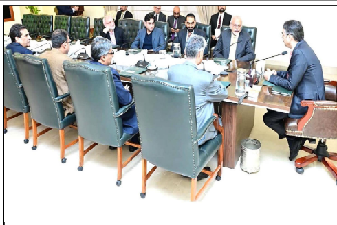
ISLAMABAD: A delegation of the Pakistan Broadcasters' Association called on caretaker Prime Minister Anwaar-ul-Haq Kakar.