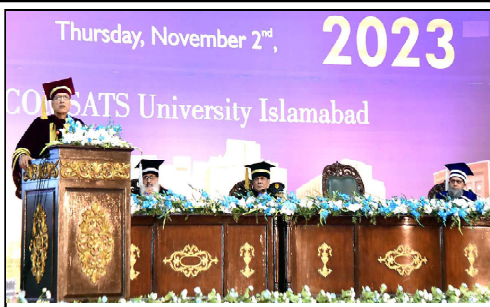
ISLAMABAD: President Dr Arif Alvi addressing the 26th Convocation ceremony of the COMSATS University.