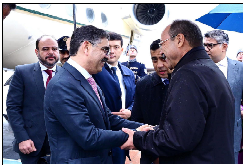
TASHKENT: Caretaker Prime Minister Anwarul-Haq Kakar is being received by Prime Minister of Uzbekistan Abdulla Nigmatovich Arifov upon his arrival in Uzbekistan to attend 16th ECO Summit.

It further said that the provincial government had already directed the district governments to conduct crackdowns against illegal fireworks vendors and check the stock of the suppliers, vendor details, stock registers and listing of the vendors. The Deputy Commissioners had also been asked to keep the vendors under strong vigilance.