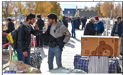
CHINA: Travelers can be seen at the Khunjerab Pass in Tashkurgan Tajik Autonomous County of northwestern Xinjiang Uygur Autonomous Region.

"Dairy products to China must be packaged in new materials that meet Chinese standards. The outer packaging shall be marked in Chinese, Urdu and English with specifications, origin (specific to the state / province / city), destination, product name, weight, manufacturer name, registration number, production batch number, storage conditions, production date and shelf life..."