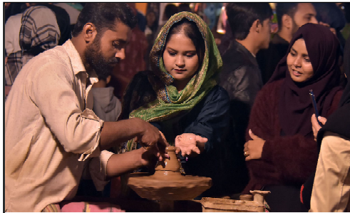
ISLAMABAD: A potter guiding a girl to make mud pots during 10 Days annual Lok Mela at Lok Versa.

The spacecraft is set to observe the asteroid's Earth flyby as it nears and ultimately catches up with Apophis. These images and data would be combined with ground-based telescope measurements to detect and quantify how Apophis was altered as it passed by Earth. OSIRIS-APEX is scheduled to remain near Apophis for 18 months— orbiting, maneuvering around it and even hovering just over its surface, using rocket thrusters to kick up loose material and reveal what lies beneath.