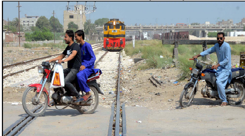
HYDERABAD: Motorcyclists crossing rail tracks as a train approaches on the same tracks may cause a mishap and need the attention of concerned authorities at Makrani Para railway crossing.

the drive, criminal proceedings would be initiated against such culprits.