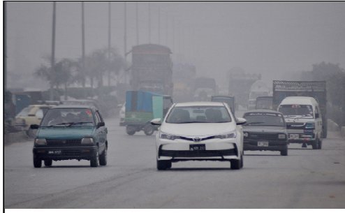
PESHAWAR: Vehicles drive on a road during fog after recent winter rain.