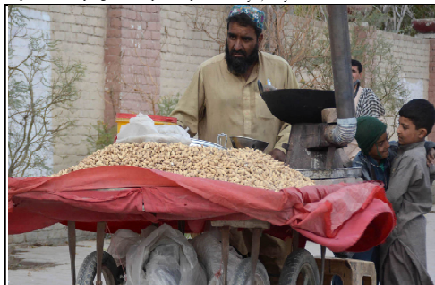
QUETTA: A vendor selling peanuts on his hand cart.