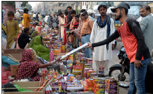
HYDERABAD: Vendors displaying the firework stuff to attract the customers in connection with Hindu festival Dewali at Market Road.

Furthermore, the project also includes capacity-building initiatives where local communities are actively involved in the conservation efforts. By engaging the local population, the project aims to create awareness about the meaning of the rock paintings and foster a sense of ownership and responsibility among the community members. Conservation efforts in the Upper Indus Rock Painting Corridor are expected to have a major impact on the tourism potential of the area. As the site becomes better preserved and accessible, it is likely to attract both domestic and international tourists, further contributing to the socio-economic development of the area.