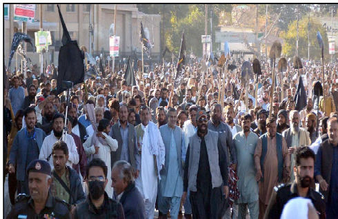
QUETTA: Activates of Zameendar Action Committee hold protest rally.

Nasir Khan highlighted the achievements of the ITP for managing traffic efficiently during adverse weather conditions and construction activities. He praised the use of modern technology, including city surveillance cameras, to enforce traffic laws and issue e-challan for the violations. The ICCPO said that the Islamabad Traffic Police, with 600 officers and officials were currently handling the city's traffic.