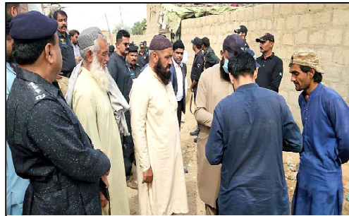
KOTRI: Officials of Kotri police investigate the illegal Afghan immigrants and arrest them during a raid in Khuda ki Basti Kotri, 14 Afghan people arrested.