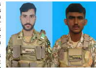
(PAF) heavily guarded M.M. Alam Base on Nov 4.

Last week, a Pakistan Army officer and three soldiers were martyred in an intelligence-based operation in the Tirah area of KP's Khyber district while terrorists had attack-keed the Pakistan Air Force's