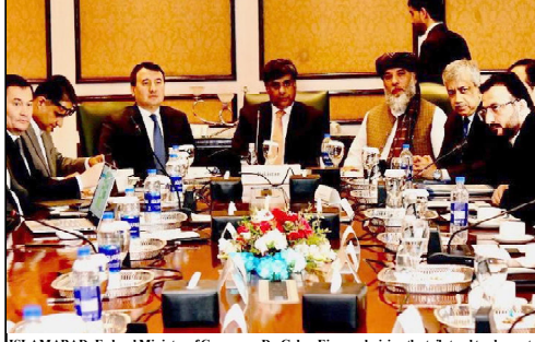
ISLAMABAD: Federal Minister of Commerce Dr. Gahar Ejaz co-chairing the trilateral trade meeting along with Afghanistan Trade Minister Nooruddin Aziz.