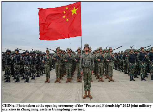
CHINA: Photo taken at the opening ceremony of the "Peace and Friendship" 2023 joint military exercises in Zhangjiang, eastern Guangdong province.