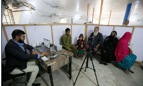
NEWSHERA, Afghan refugees are registering at UNHCR's refugee camp and repatriation center.

So Saudi Arabia-based goalkeeper Youssef Al-Nasser, Paris Saint-Germain defender Achraf Hakimi and Sevilla forward Youssef En-Nesyri go into action for the Atlas Lions only next Tuesday. Their belated entry into qualifying will be away to Tanzania in Group E, which also includes resurgent Zambia, Congo Brazzaville and Niger, who are set to hire Moroccan coach Badou Zaki. The nine group winners after 260 qualifiers that stretch to October 2025 qualify for the record 48 nation finals in the United States, Canada and Mexico. There could be a 10th African qualifier as the best four runners-up enter a mini-tournament and the winners advance to inter-continental play-offs with two finals places up for grabs.