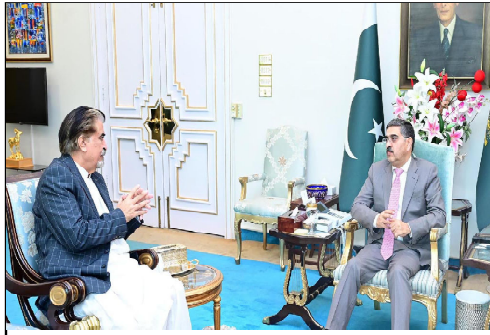
ISLAMABAD: Caretaker Minister for National Heritage and Culture Syed Jamal Shah called on caretaker Prime Minister Anwar-ul-Haq Kakar.