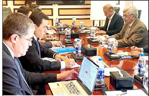
ISLAMABAD: Caretaker Federal Minister Food and Security & Research meeting with the Uzbekistan Deputy Prime Minister on Trade and Investment Jamshaid Khodjaev.

The UAE's support is significant for Pakistan as it comes at a time when the country is facing economic challenges. The IMF's loan program is crucial for Pakistan to meet its external financing needs and to stabilize its economy. The UAE's support will also help to boost investor confidence in Pakistan and attract more foreign investment.