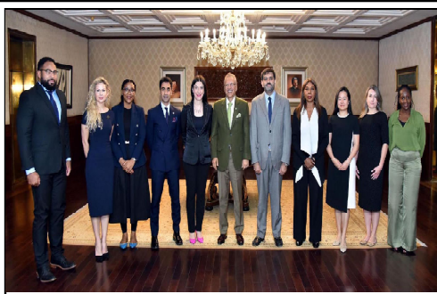
ISLAMABAD: President Dr Arif Alvi in a group photo with delegation of Oxford Alumni at aiwan-e-sadr.