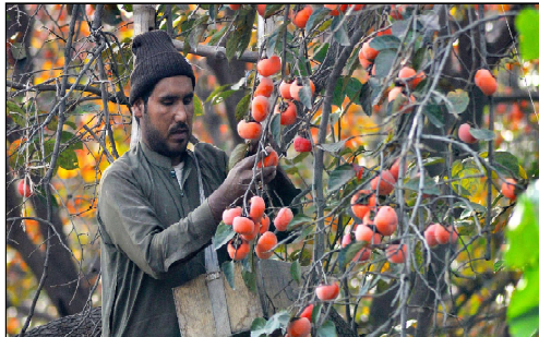
PESHAWAR: Worker busy in plucking Japanese fruit at farm house.

dismissed the petition for non-compliance. It is pertinent to note that a contempt of court petition was filed in the IHC against PML-N leader Nawaz Sharif for his anti-judiciary speeches in 2018. The court had fixed the five years old petition for hearing today. The registrar's office had issued a cause list for fixing the case. It is to be noted that Nawaz Sharif landed in Pakistan after ending his self-exile of four years, last month.