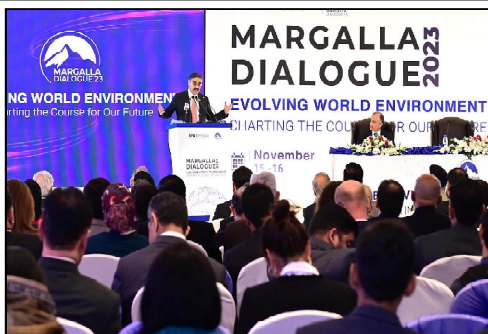
ISLAMABAD: Caretaker Prime Minister Anwaar-ul-Haq Kakar addressing the inaugural session of annual Margalla Dialogue 2023.