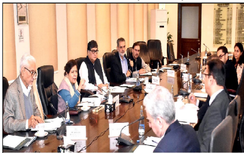
ISLAMABAD: Caretaker Federal Minister for Finance, Revenue, and Economic Affairs Dr. Shamshad Akhtar chaired the meeting of the Cabinet Committee on State Owned Enterprises.

The KP police [officials] are the worst [investigators], the chief justice continued.