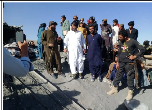
Trapped Coal Miners

"They told us we wouldn't reach the outskirts of Gaza City and we did, they told us we wouldn't enter Al-Shifa (hospital) and we did," he said hours after troops raked the territory's biggest hospital. NEWS DESK