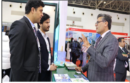
BEIJING: Ambassador of Pakistan to China Khalid Hashmi interacting with Pakistanis Tourism Exhibitors at the China outbound Travel and Tourism Market (COTTM) Expo-2023 at China National Agriculture Center.

10 years of efforts. In the last three years, the average annual sales of hybrid rice seeds have been around 5 million kg with a market share of about 40 percent, ranking first among all seed companies in Pakistan. With an annual uplift of over 800,000 acres of mixed rice, an annual increase of over 1.5 million tons of rice and an annual increase of over $300million in foreign exchange, the team has made an outstanding contribution to the grain increase.