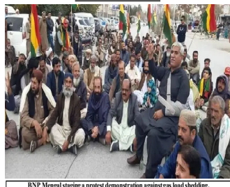
BNP Mengal staging a protest demonstration against gas load shedding.

Amidst the protest, impassioned participants wielded placards and banners adorned with poignant slogans, specifically target-