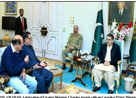
ISLAMABAD: A delegation of Gwadar Shipping Clearing Agents calls on Caretaker Prime Minister Anwaar-ul-Haq Kakar.