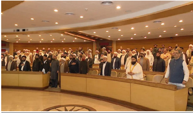
Religious scholars in a meeting with COAS, General Syed Asim Munir