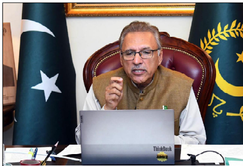
ISLAMABAD: President Dr Arif Alvi virtually addressing the 12th biennial conference of the Pakistani Society of Cardiovascular and Thoracic Surgeons held in Peshawar.

Dr Arif Alvi said cardiovascular diseases were also being diagnosed in young people and mentioned that the lengthy treatment and surgery of cardiac diseases had become unaffordable for the patients. Therefore, he