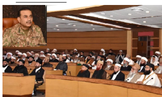
Islamic Scholars Condemn in Meeting with COAS

COAS signified the role of Ulema in harnessing youth towards understanding of Quran and Sunnah and character build-