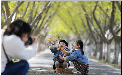
CHINA: A woman makes pictures of children blooming with leaves in a park in Jahangir Du District, Yangzhou City, East Jiangsu Province.

"Prime Minister [Anwaarul Haq Kakar] has given very clear instructions that there should be no manhandling of illegal immigrants during the repatriation process," the interior minister said while speaking on the Senate floor. Sarfraz Bugti also assured the House that any mismanagement on the borders would be checked and suggestions from the political leadership in this regard would be welcomed. "No Afghan refugee having legal documents has been even touched," he added.