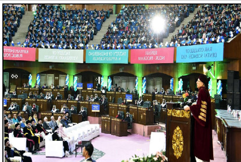
ISLAMABAD: President Dr Arif Alvi addressing the 18th Convocation ceremony of the Riphah International University.