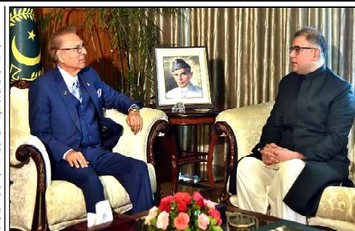
ISLAMABAD: Pakistan's Ambassador-designate to Bulgaria called on President Dr Arif Alvi at Aiwan-e-Sadr.