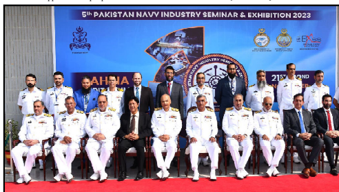
KARACHI: Chief of the Naval Staff, Admiral Naveed Ashraf in group photo with participants of 5th Pakistan Navy Industrial Seminar held at Bahria Auditorium, Karachi.

was received from China, constituting 29.33% of the total investment received by Pakistan in the July-October period of FY 2023-24. In October 2023, the power sector in Pakistan garnered a total of $48.2 million in FDI, distributed across various sub-sectors: $28 million in coal, $17.2 million in hydro, and $3 million in thermal.