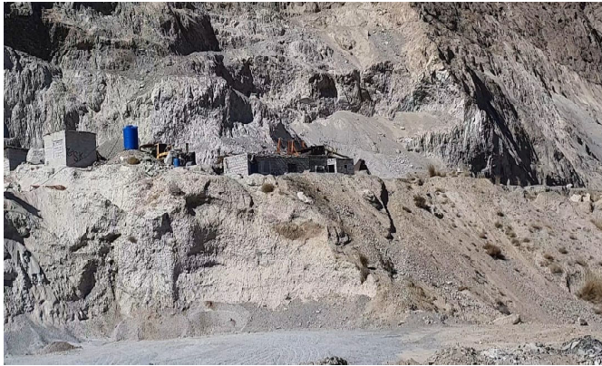
Stone crushing plant on the Western outskirts of Quetta, the provincial capital of Balochistan.