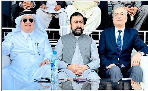
ISLAMABAD: Caretaker Federal Minister for Interior, Sarfraz Ahmed Bugti witnessing the Pakistan vs Tajikistan FIFA World Cup Qualifier match as Chief Guest.