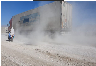
Dust-blowing near a container passing in the Western Bypass area of Quetta close to a stone-crushing plant.

A senior official from the Balochistan Environment Department, speaking on the condition of anonymity due to the sensitivity of the matter, has acknowl-