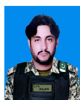
2 killed, 2 injured in Bajaur blasts

"Sanitisation operation is being carried out to eliminate any terrorists present in the area as the security forces of Pakistan are determined to eliminate the menace of terrorism and such sacrifices of our brave soldiers further strengthen our resolve," the ISPR said.