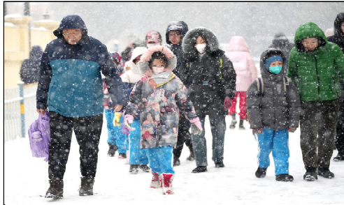
CHINA: Parents drop their children off at school during snowfall in Harbin, the capital of China's northeastern Heilongjiang province.