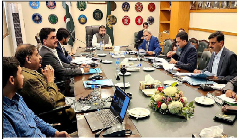
ISLAMABAD: Caretaker Federal Minister for Interior Sarfaraz Ahmad Bugti chairing a meeting of the Cabinet Sub-Committee on ECL.

The ANF Sindh recovered 36,258 kg drugs in five operations while arrested three accused in drug smuggling and impounded a vehicle. The seized drugs comprised 31,200 kg Hashish and 58 grams Heroin. The ANF North recovered 15,164 kg drugs in eight operations while arrested nine accused in drug smuggling and impounded four vehicles. The seized drugs comprised 11,800 kg Hashish, 756 grams Opium, 400 grams Methamphetamine (ice), 2,086 kg Ecstasy Tablets (3550 tabs) and 122 grams Amphetamine. Separate cases in all incidents were registered at respective ANF Police Stations under CNS Act 1997 (Amended 2022) and further investigations were under process.