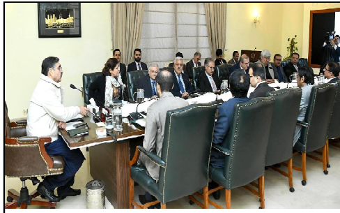
ISLAMABAD: Caretaker Prime Minister Anwaar-ul-Haq Kakar chairs a meeting on preparations with regard to COP-28.