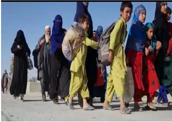
1,20,000 Afghan refugees have been repatriated via the Pak-Afghan border Chaman.