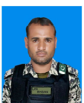
jured in two separate blasts in KP's Bajaur, according to officials.

Meanwhile, two people were killed while two others were in-