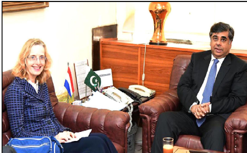
ISLAMABAD: Dutch Ambassador to Pakistan Henny Fokel de Vries meeting with Caretaker Minister of Commerce and Industries Dr. Gohar Ejaz.

warned that strict action would be taken against those found engaged in corrupt practices within the department. He also called for the submission of a detailed data report on the property taxes of the Awqaf Department. The ban on sub-leasing and the establishment of a rent review committee are significant steps towards ensuring the responsible management of Awqaf Department properties and promoting transparency within the department. These measures are expected to deter corruption, increase revenue, and enhance the overall functioning of the Awqaf Department.