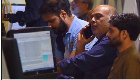
KARACHI: Pakistani stockbrokers monitor the share prices during a trading session at the Pakistan Stock Exchange (PSX) in Karachi, Pakistan, 22 November 2023. The Pakistani benchmark 100 index was up 58,233.34 with 861.76 points during the trading session.

Earlier this month, South Africa recalled its ambassador to Israel and withdrew all its diplomatic staff from the country. The conflict will also be the subject of a virtual meeting of BRICS countries on Tuesday, which will be attended by leaders of the bloc, including Ramaphosa, Russian President Vladimir Putin and Chinese President Xi Jinping. The economic bloc was formed by Brazil, Russia, India and China in 2009 and added South Africa in 2010, Iran, Saudi Arabia and the United Arab Emirates, Argentina, Egypt and Ethiopia are also set to enter BRICS.