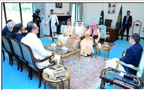
ISLAMABAD: Imam-e-Kabah Professor Dr. Sheikh Saleh bin Abdullah bin Humaid calls on Caretaker Prime Minister Anwaar-ul-Haq Kakar.

Previously, Fitch and Standard & Poor's had downgraded the U.S. sovereign credit rating from the top-notch 'AAA' to 'AA+'. Now, all three major international rating agencies express significant concerns about the prospects of U.S. sovereign debt. The loss of confidence worldwide is catastrophic for U.S. Treasuries, a global anchor for asset values.