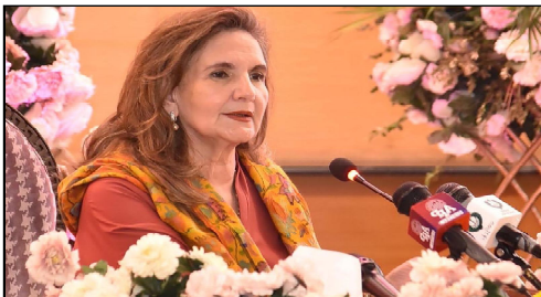
ISLAMABAD: First Lady begum Samina Alvi addressing a breast cancer awareness event

knitwear sector has been performing better than all other export sectors and the potential for its further growth is tremendous. If due support is extended this sector can outperform to bring the country out of all kinds of crises, besides earning foreign exchange and providing mass employment in the country. "We have due regard for nomination of some respectable personalities on the Council, but ignoring and neglecting the extremely important Small and Medium components of the industry and the sector as a whole, is totally unacceptable," he added. The PHMA leaders said that the sector has been major taxpayer in the largest employment generator in the entire textile chain and earning billions of dollars for foreign exchange through exports goods.