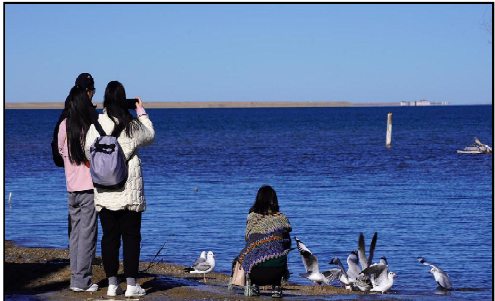
CHINA: Tourists enjoy the view at Qinghai Lake in the northern province of Changhai

The chief minister was also briefed about the upgradation of the Lahore Zoo and Safari Park, and Safe City projects in Faisalabad, Rawalpindi, and Gujranwala.