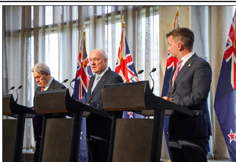
NEW ZEALAND: New Zealand leader and future Prime Minister Chris Hipkins (centre) addresses Parliament in Wellington.