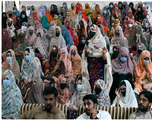
A student asking a question during a seminar held in Balochistan's Panjgur district

However, the minister cautioned that success in these endeavors relies heavily on ensuring that the youth are equipped with the necessary skills and training demanded by the evolving