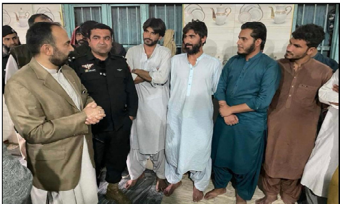
QUETTA: Balochistan Caretaker Home Minister, Captain (R) Zubair Jamali visiting District Jail Quetta

As the investigation unfolds, the FIA Cybercrime Circle in Quetta remains steadfast in its mission to safeguard citizens from online threats and to uphold the rule of law in the digital realm.