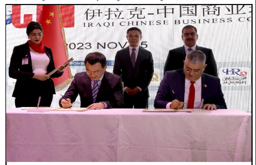
IRAQ: The document for the establishment of the Iraqi-Chinese Business Coun-