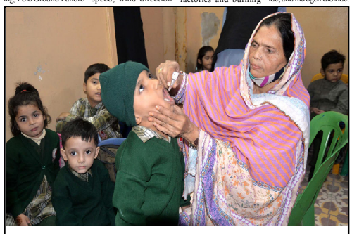
HYDERABAD: Health worker administering polio drops to a child during Anti-Polio vaccii campaign at Primary School, Latifabad.