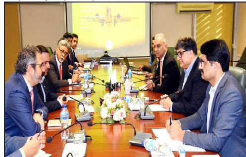
ISLAMABAD: Caretaker Federal Minister for Privatisation Fawad Hasan Fawad chairing a meeting regarding signing of Financial Services Agreement for Divestment of PFIACL.

Pakistan Test squad: Shan Masood (c), Aamer Jamal, Abdullah Shafique, Abar Ahmed, Babar Azam, Faheem Ashraf, Hasan Ali, Imam-ul-Haq, Khuram Shahzad, Mir Hamza, Mohammad Rizwan, Mohammad Wasim Jr, Noman Ali, Saim Ayub, Agha Salman, Sarfaraz Ahmed, Saud Shakeel, Shaheen Afridi.