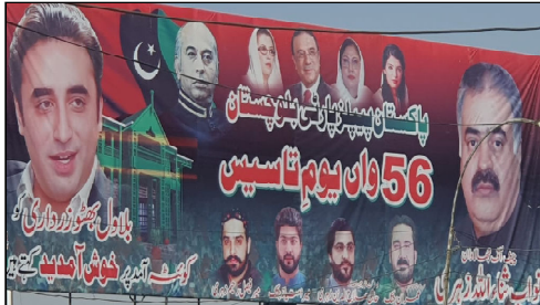
QUETTA: Banners installed in Quetta on the eve of 56th Youth e Taseses of PPP

The students will be responsible for late assignment submission, and assignments reaching after the due dates will not be accepted.