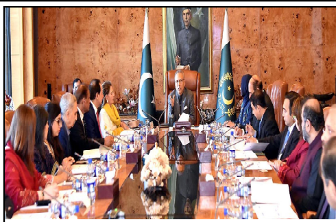
ISLAMABAD: President Dr. Arif Alvi chairing a meeting on mental health issues in Pakistan, at Aiwan-e-Sadr.