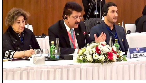
TURKIYE: Opposition Leader in Senate, Senator Dr. Shahzad Waseem addressing on Asian Parliamentary Assembly (APA) Executive Council meeting.

Replies to a question, the administration has started strict crackdown and announced to charge heavy fines for violations of the traffic rules, adding that around 33 to 34 crore vehicles were being imposed fines for violating traffic rules. The purpose of imposing fines is to prevent people from using vehicles that increase pollution. The crackdown will continue till next month, he added.