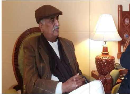
Syed Khurshed Shah, PPP leader

The PPP stalwart said his party would give a surprise and emerge as the largest parliamentary in the first approaching general elections. "With 128 members, PPP made positive strides in the country", Mr.