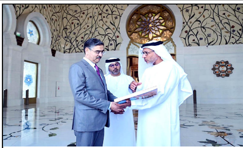
ABU DHABI: Caretaker Prime Minister Anwaar-ul-Haq Kakar visits the Sheikh Zayed Grand Mosque.