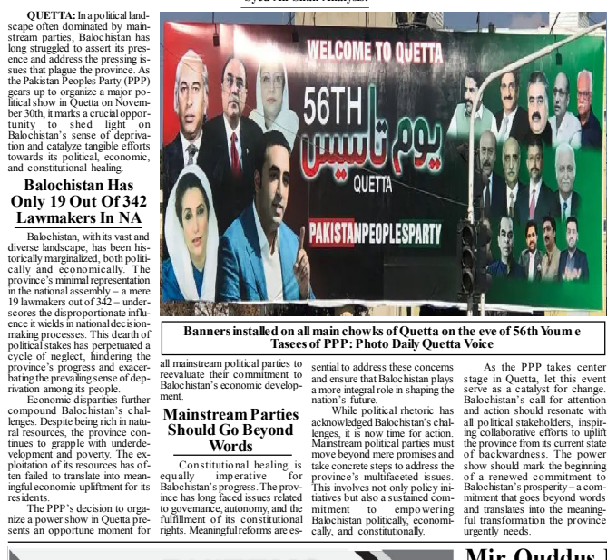
Banners installed on all main chowks of Quetta on the eve of 56th Youm e Tasees of PPP