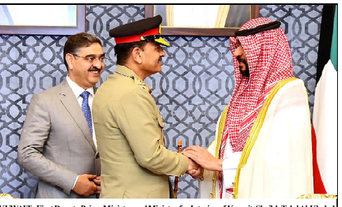
KUWAIT: First Deputy Prime Minister and Minister for Interior of Kuwait, Sheikh Talal Al-Khale Al-Ahmad Al-Sabah shake hand with Chief of Army Staff (COAS) General Asim Munir. Caretake Prime Minister Anwaar-ul-Haq Kakar also present.