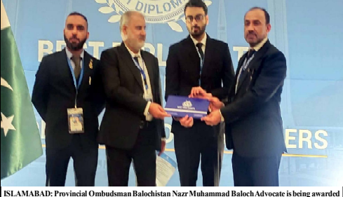
SLAMABAD: Provincial Omb