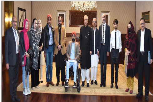
ISLAMABAD: President Dr Arif Alvi in a group photo with a delegation of Center for Peace and Development initiatives comprising social activists and persons with disabilities, at Atiwan-e-Sadr.

The ECP and President Arif Alvi had agreed earlier this month on Feb 8, 2024, as the date for polls — an announcement that has stirred activity in the camps of major political parties.