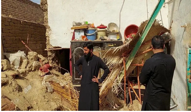
File Photo: Levies personnel reached the house that was collapsed as a result of the earthquake in Chaman.