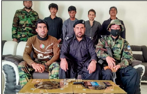
CHAMAN: Robbers under the custody of Chaman levies

The decline in pulse prices is due to a number of factors, including increased supply and lower demand.