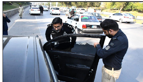
ISLAMABAD: Excise and taxation officer putting off illegal black papers from cars as part of their citizens safety campaign.

PRO No. 11/10/05-19-2023 www.apr.gov.pk | @aprc-pan | @aprc | @aprc.kabul@afghanistan