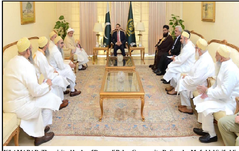
ISLAMABAD: The spiritual leader of Dawood Bohra Community, Dr Sayedna Mufaddal Saifuddin, along with a delegation called on Caretaker Prime Minister Anwaar-ul-Haq Kakar.