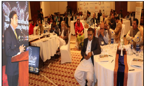
QUETTA: Chief Guest, Caretaker Provincial Health Minister Dr. Ameer Muhammad Khan Jogezi addressing the participants of (PFPF) Family Planning.

for National Assembly seats in Khyber Pakhtunkhwa, 3 for Islamabad, 141 for Punjab, and 61 for Sindh. Balochistan will have 16 ROs and AROs. The Election Commission has also appointed 8 ROs for specific seats of the National and Provincial Assemblies. The notifications specify that Deputy Commissioners will serve as DROs during the general elections, and separate ROs have been assigned for each constituency. In addition to bureaucratic appointments, the Election Commission has recruited ROs from provincial and federal departments. Notably, there will be a ban on transfers of election duty officers. The commission has terminated holidays in the election wing, signaling the imminent commencement of the election schedule. The training phase for appointed ROs has commenced, with sessions scheduled at 38 locations nationwide. The training aims to equip ROs with the necessary skills for the electoral process. The subsequent phase will involve finalizing the polling scheme.