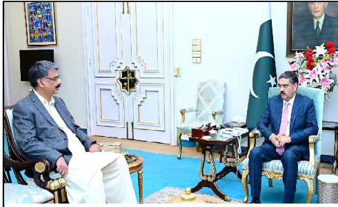
ISLAMABAD: Prime Minister of AJK Chaudhry Anwar-ul-Haq Kakar calls on Caretaker Prime Minister Anwar-ul-Haq Kakar.