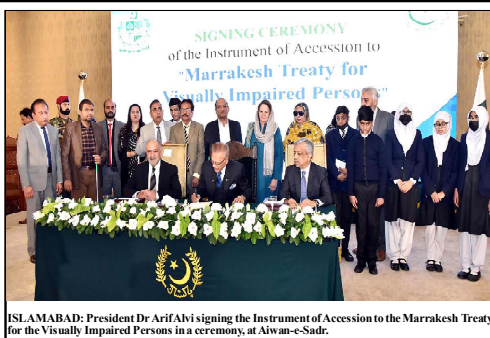
ISLAMABAD: President Dr Arif Alvi signing the Instrument of Accession to the Marrakesh Treaty for the Visually Impaired Persons in a ceremony, at Aiswan-e-Sadr.

ISLAMABAD (INP) President Dr. Arif Alvi has strongly denounced the terrorist attack on security forces in Dera Ismail Khan. In a statement, he said such cowardly acts cannot shake the resolve of our security personnel. He said sacrifices of martyrs will not go in vain. The President commiserated with the bereaved families. Caretaker Prime Minister Anwaar-ul-Haq Kakar has strongly condemned the terrorist attack on security forces in Darabara area of Dera Ismail Khan. In a statement, he said the security forces cannot be demoralized by such cowardly acts. He said the entire nation salutes the martyrs who sacrificed their