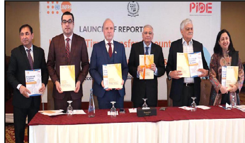
ISLAMABAD: Caretaker Minister for Planning Development and Special Initiatives, Muhammad Sami Saeed launches the reports of National Transfer of Account & Provincial Transfer Accounts in collaboration with UNFPA and PIDE at local hotel.

the role of China's vocational education and training centers. Having trained there, Uyghur Muslims are becoming well-equipped with modern skills to fit for merits of jobs.