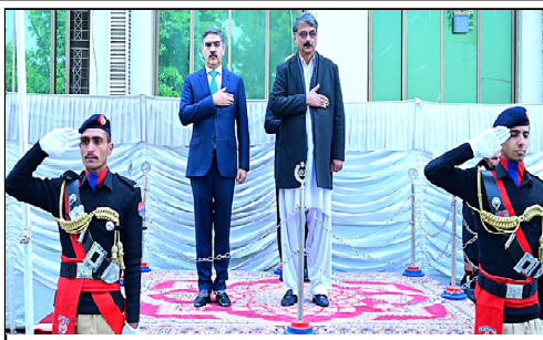
MUZAFFARABAD: Caretaker Prime Minister Anwaar-ul-Haq Kakar observes the Guard of Honour by the Azad Jammu and Kashmir Police Guards.