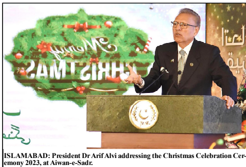
ISLAMABAD: President Dr Arif Alvi addressing the Christmas Celebration Ceremony 2023, at Aitwan-e-Sadr.