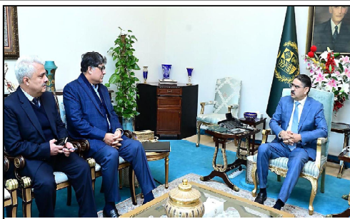
ISLAMABAD: Caretaker Minister for Privatisation and Inter-Provincial Coordination Fawad Hussain Fawad calls on the Caretaker Prime Minister Anwar-ul-Haq Kakkar.

Looking into the future, 54.2% of the respondents think CPEC should focus on business opportunities more, followed by education (13%), health (5.9%), IT (2.3%), etc. Overall, the majority of the respondents perceive CPEC positively as a game-changer for Pakistan's economy.