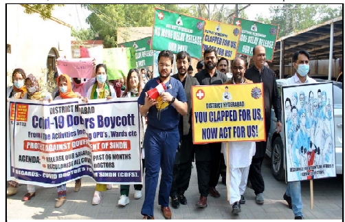
HYDERABAD: Doctors and Health workers hold a protest rally after boycott from COVID-19 activities, at DHO office on Hyderabad.

The ECC was informed that the outsourcing of three airports has been initiated within the scope of the Public-Private Partnership Act-2017 to engage private investors through a competitive and transparent process to run the airports, develop appertaining land assets and enhance avenues for commercial activities and gamer full revenue potential.