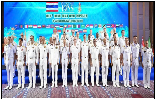
BANGKOK: Chief of the Naval Staff Admiral Naveed Ashraf in group photo with participants of 8th Indian Ocean Naval Symposium (IONS) Conclave in Thailand.

Overall, the expanding trade surplus with Southern Europe paints a promising picture for Pakistan's economic outlook. With sustained efforts to boost exports and optimize imports, the country is well-positioned to strengthen its trade ties with this important region.