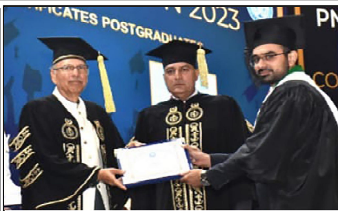
KARACHI: President Dr Arif Alvi giving away the degree and gold medal in the Pakistan Navy Engineering College