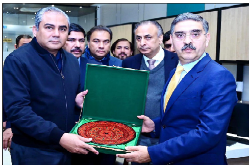
LAHORE: Caretaker Chief Minister Punjab Syed Mohsin Raza Naqvi presents caretakeer Prime Minister Anwaar-ul-Haq Kakar with a souvenir in the Business Facilitation Center in Lahore.