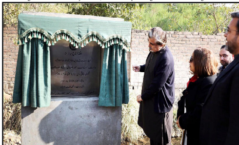
ISLAMABAD: Jamal Shah, Caretaker Federal Minister for National Heritage and Culture inaugurating Shah Alla Ditta Caves development, conservation & preservation project.