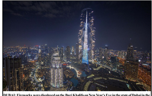
DUBAI: Fireworks were displayed on the Burj Khalifa on New Year's Eve in the state of Dubai in the United Arab Emirates (UAE).

pensate for the losses it of the defendants' actions has suffered as a result."