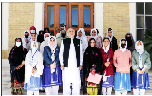
QUETTA: Group photo of Balochistan Governor Malak Abdul Wali Khan Kakar with female students from Turbat on the occasion of their visit to Governor House Quetta.

Year's Day address. In 2023, Pyongyang successfully launched a reconnaissance satellite, enshrined its status as a nuclear power in its constitution and tested the most advanced intercontinental ballistic missile into its arsenal. Pyongyang declared itself an "irreversible" nuclear power in 2022 and has repeatedly said it will never give up its nuclear weapons programme, which the regime views as essential for its survival. The United Nations Security Council has adopted many resolutions calling on North Korea to halt its nuclear and ballistic missile programmes since Pyongyang first conducted a nuclear test in 2006.