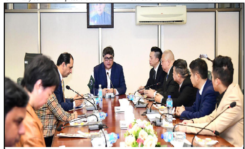
ISLAMABAD: Caretaker Federal Minister for Privatisation, Fawad Hasan Fawad in a meeting with Chinese Business Delegation at Privatisation Division.