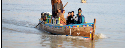
HYDERABAD: People are enjoying boat riding at Indus River Jamshoro.

Meanwhile, commercial buildings up to 10000 square yards will also be approved within three days. A separate desk has also been established for all these matters. It should be noted that