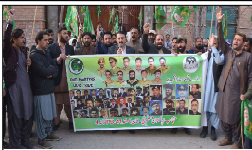
Quetta: Workers of Muslim League (N) hold a rally to pay tribute to martyrs of the Pak Army.