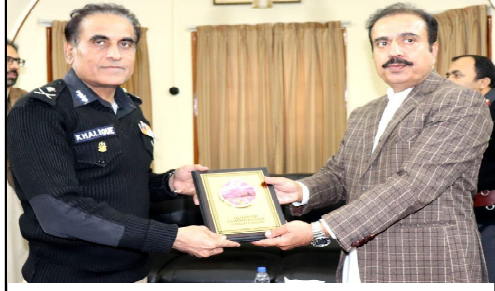
QUETTA: Commissioner Loralai Division, Balach Aziz presenting a memorial shield to Inspector General of Police Balochistan, Abdul Khaliq Sheikh

The spike in violence against police raises concerns about security in the city and surrounding areas. Call for Justice and Protection: Local officials have condemned the attack and expressed condolences to the victim's family. They have called for swift action to identify and apprehend the attackers. Impact on Community: These attacks have sparked fear and anxiety among residents of Quetta. Many are calling for increased security measures to protect police officers and ensure the safety of the community.