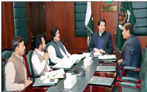
Quetta: Finance Secretary Bahar Khan presiding over a meeting regarding the fund for employment on internship basis issues in Balochistan Directorate of Public Relations.

ing on 20,000 small-scale entrepreneurs to increase revenues and contribute to a positive balance of trade. The minister stated that the Ministry of Commerce has organized visits for small and medium-sized business owners to Egypt, China, and GCC countries to explore new markets. These efforts have already shown successful results in expanding trade opportunities.