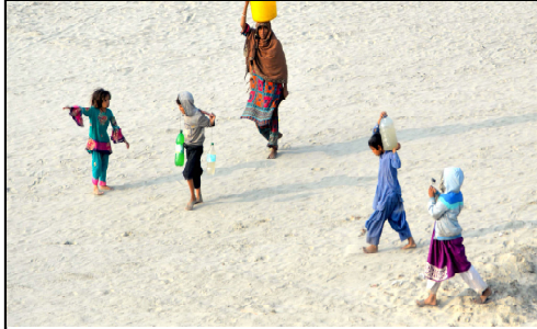
HYDERABAD: A family on their way back after filling their pots with water from the Indus River.

Forceful marriages unfortunately remain a part of society as the practice is followed religiously in Pakistan in name of family honour despite various legislations introduced to arrest domestic violence and extend women rights across the country without any discrimination based upon caste and creed as well social status. The reason behind the state failure to provide protection to more