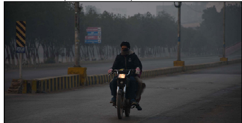
HYDERABAD: A View of Fog in Hyderabad City.

Japan side of the country's main Honshu island. The bad weather threatened to further hamper the challenging recovery mission of thousands of police, troops and power rescue workers. It could also worsen conditions for more than 30,000 people in 366 government shelters as of Saturday, with relief materials slow to reach areas suffering water and power outages. "The first priority has been to rescue people under the rubble, and to reach isolated communities," Prime Minister Fumio Kishida said in an interview with NHK on Sunday. The military has sent small groups of troops to each of the isolated communities on foot, he said. The government has also "deployed various police and fire department helicopters, to access them from the sky", Kishida added. "In parallel with these efforts, we need to improve the conditions in shelters, and the health of those suffering in the disaster," because they may have to stay in place for extended periods, he warned. In Anamizu city, rescuers in heavy-duty orange or blue waterproofs were seen carrying a body of a landslide victim covered in blue tarp under a toppled pylon. And among the widespread destruction in the city of Wajima, the traditional red gate of one shrine remained standing, but the view through it was a now-familiar mess of splintered wood and toppled beams. Japan experiences hundreds of earthquakes every year and most cause no damage, with strict building codes in place for more than four decades.