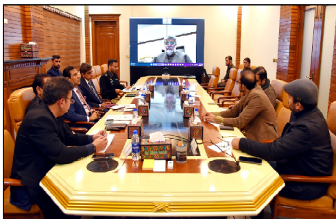
QUETTA: Caretaker Chief Minister Balochistan Mir Ali Mardan Khan Domki is presiding over a high-level meeting on peace and security through video link.