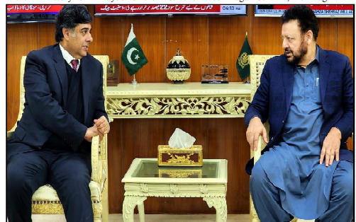
ISLAMABAD: Chief Minister GB Haji Gul Bar Khan in a meeting with caretaker Federal Minister Interior Industry & Production Dr. Gohar Ejaz at his office.

Ten Hag hopes Antony can use his performance as a springboard for a successful run in the second half of the season. 'Antony had the assist on the first goal for Bruno and a goal. So end product, that is what we demand from him,' Ten Hag said.