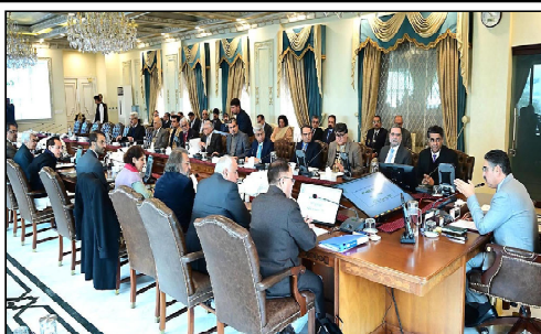
ISLAMABAD: Caretaker Prime Minister Anwaar-ul-Haq Kakar chairs meeting of the Federal Cabinet.