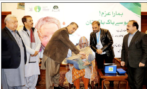
QUETTA: Governor Balochistan Malik Abdul Wali Khan Kakar is inaugurating the seven-day anti-polio campaign 2024 by administering polio drops to children.