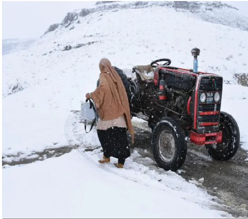
A female polio worker walking over snow as tractors are busy in clearing the road: Photo provided by the EOC.

With each step they took, they brought hope and protection to the most vulnerable members of society, ensuring that no child would fall victim to the debilitating effects of polio.