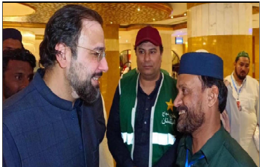
MADINAH: Federal Minister of Religious Affairs and Interfaith Harmony, Chaudhry Salik Hussain meeting with Pakistani pilgrims in Madinah.