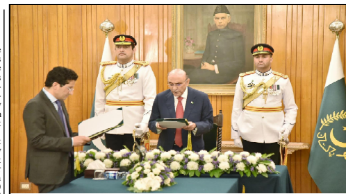
ISLAMABAD: President Asif Ali Zardari administering the oath of office to Mr. Ali Pervaiz as the Minister of State, during an oath-taking ceremony, held at Awan-e-Sadr.