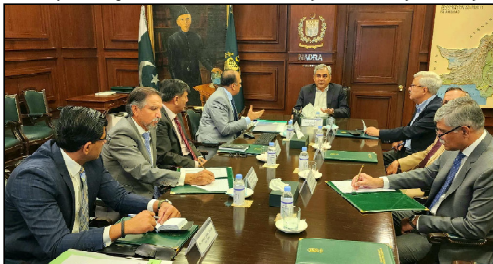
ISLAMABAD: Federal Minister for Interior Mohsin chairing a meeting at NADRA Headquarters.

Heritage Act 2005. Minister Bharat commended proposed amendments by the Punjab Employees Social Security Institute, particularly in facilitating the establishment of a medical college in Faisalabad. Additionally, Minister Malik stressed the importance of tax compliance as a national duty, urging citizens to fulfill their obligations. Minister Bharat highlighted the significance of promoting religious tourism in Punjab, emphasizing the need for effective utilization of resources by the Tourism Department to showcase the region's rich cultural heritage. The session concluded with a directive from Minister Rehman to relevant authorities to ensure meticulous planning and execution of proposed initiatives, underscoring the government's unwavering commitment to fostering socio-economic development in Punjab.