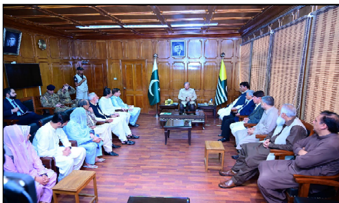
MUZAFFARABAD: A delegation of Pakistan Muslim League (N) Azad Jammu and Kashmir calls on Prime Minister Muhammad Shehbaz Sharif.

"If [I] have done wrong then name me [but] will not allow the institution (judiciary) to be targeted," the top judge asserted. Stating that institutions belonged to the public, CJP Isa observed that "defaming" them was not equivalent to serving the country. "There can be faults in institutions. I cannot bear someone else's burden," he added. The chief justice then said that if a wrong decision had been made, then "criticism" should be done. He further said that the judiciary was "trying to do good deeds", highlighting that the apex court was also following the Practice and Procedures Act. Justice Isa noted that one to wield a gun was the weakest as "he has nothing to say", adding that the second-most weakest person was who hurled abuses. "A person who would have [valid] arguments would silence even us judges," he said. The top judge emphasized that he had taken oath of his role "not for himself but for the institution".