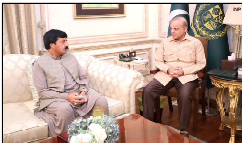
LAHORE: Governor of Punjab Sardar Saleem Haider calls on Prime Minister Muhammad Shehbaz Sharif.