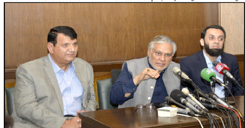
LAHORE: Deputy PM of Pakistan and Minister for Foreign Affairs, Ishaq Dar, Federal Minister Attaullah Tarar and Federal Minister for Kashmir Affairs, Ameer Muqam holding a press conference.

Citizens are urged to stay informed through various media channels and take necessary precautions to combat the impending heatwave onslaught.