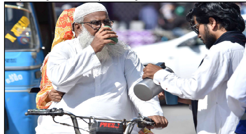
KARACHI: Villoters distributing water to the Passengers during a hot day in the city near the Numash Chowrang.

vestors and Chinese government has in this government," he said adding that "China considers Pakistan as a strategic friend and has confidence in Pakistan." Regarding the security of the Chinese nationals, the minister reaffirmed the government's commitment for ensuring security of Chinese nationals and said that a special security unit as well as law enforcement were tasked with ensuring their safety. Another question regarding issues of security threats, the minister maintained that when you were fighting terrorism, the terrorists always tried to find a way somewhere. Ahsan Iqbal said that the Chinese government had made it very clear that such cowardly incidents would not deter them from pursuing CPEC. The minister further informed that Pakistan was not opposed to Afghanistan's inclusion in a Chinese-funded mega-development project, but would like Beijing to persuade Kabul to crack down on terrorist groups operating on its soil.