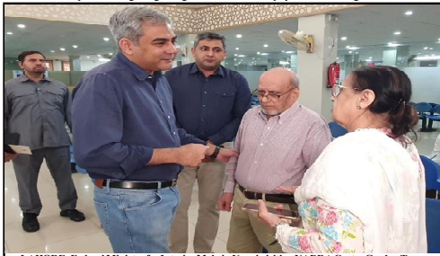
LAHORE: Federal Minister for Interior Mohsin Naqvi visiting NADRA Center Garden Town.