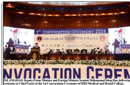
ISLAMABAD: Deputy Prime Minister and Foreign Minister Senator Mohammad Ishaq Dar, delivering remarks as Chief Guest at the 1st Convocation Ceremony of HBS Medical and Dental College.