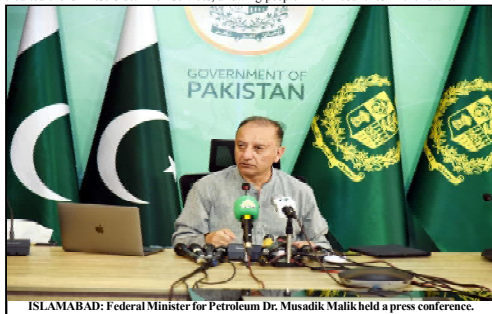
ISLAMABAD: Federal Minister for Petroleum Dr. Musadik Malik held a press conference.

It will help meet the growing demand for high-speed internet and seamless connectivity. Therefore, the launch of MM-1 is seen as a testament among the locals to the strong collaboration and partnership between Pakistan and China in the field of space technology. They believe this partnership will continue to benefit both countries in the future.