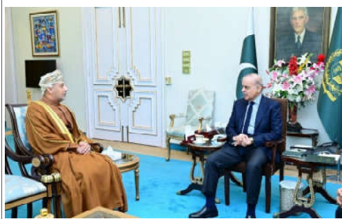
PM Shehbaz "strongly condemns" the recent terrorist attack on an imambargah in

He emphasized the importance of stability and continuity in governance for the province. As discussions about his leadership continue, Bugti remains resolute in his dedication to steering Balochistan towards progress and unity, navigating challenges with a focus on inclusive governance and sustained development.