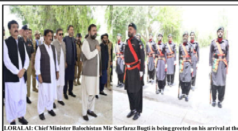
LORALAI: Chief Minister Balochistan Mir Sarfaraz Bugti is being greeted on his arrival at the Commissioner's Office Loralai.

News television channels and state broadcaster BTV were off the air while entertainment channels continued normal transmission, a Reuters witness said. Some news channels displayed a message which said they were unable to broadcast due to technical reasons and that programming would be back soon, the witness said. Streets in the capital Dhaka were deserted on Friday, which is a weekly holiday in the country. There was little traffic and very few rickshaw pullers on the streets and thin crowds near a vegetable and fish market, he said, adding that a protest rally had been called at the main mosque at around 0800 GMT. The nationwide agitation, the biggest since Hasina was re-elected earlier this year, has been fuelled by high youth unemployment.