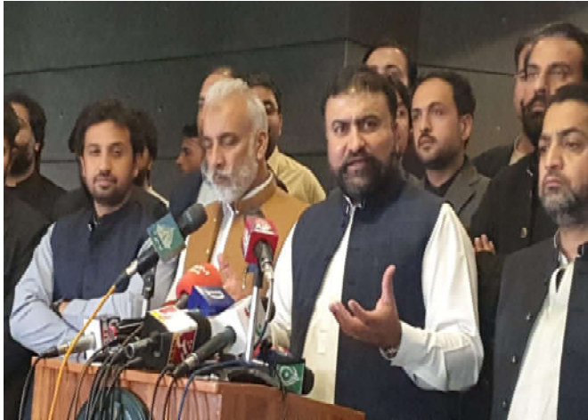
File photo: Chief Minister Balochistan, Mir Sarfaraz Bugti talking to reporters: Daily Quetta Voice