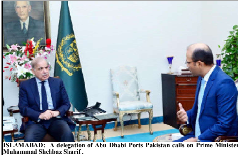
ISLAMABAD: A delegation of Abu Dhabi Ports Pakistan calls on Prime Minister Muhammad Shehbaz Sharif.