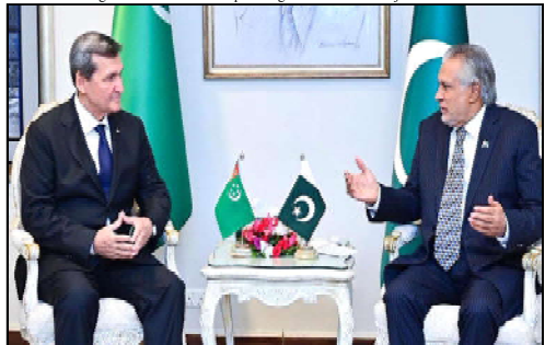
ISLAMABAD: Deputy Prime Minister and Foreign Minister Senator Mohammad Ishaq Dar hold talks with Foreign Minister of Turkmenistan Rashid Meredov.

"All state institutions must work together to fulfill their responsibilities," she concluded, reaffirming the government's commitment to a cleaner, healthier Punjab.