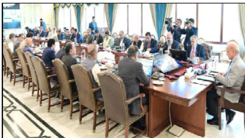
ISLAMABAD: Prime Minister Shehbaz Sharif chaired a meeting of the National Export Development Board.