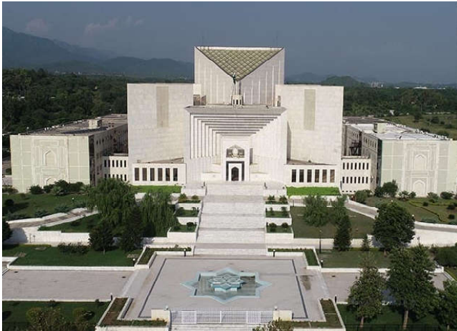
PPP objects to granting reserved seats to PTI, arguing that it had not claimed any entitlement to them