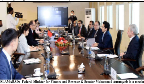
LAMABAD: Federal Minister for Finance and Rev ith Charge D- Affairs Shi Yuanqiang and other offic nue & Senator Muhammad A als of the Embassy of People's sy of People's Rep

a sustainable future". The FoodAg 2024 will bring Interna tional and local communities to gether to generate a hope fo The