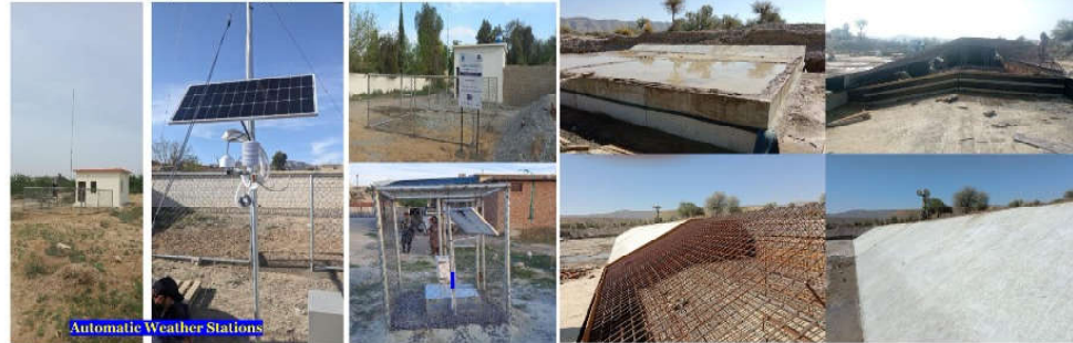
Large collage of images showing various water management infrastructure including automatic weather stations, irrigation systems, and storage structures.