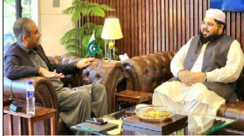
ISLAMABAD: Federal Minister for Interior Mohsin Naqvi in a meeting with Jamiat Ulema-e-Pakistan (JUP) Secretary General Owais Noorani.

said. "It's a wonderful opportunity to introduce Pakistani handicrafts to the people of Xizang. I hope this platform will not only enhance the visibility of our craftsmanship but also foster a deeper appreciation for our rich cultural heritage." With over 600 international merchants in attendance, the event fostered a vibrant atmosphere of networking and collaboration, providing a unique platform for exhibitors to showcase their products and explore new markets.