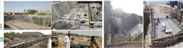
Collage of images showing various irrigation schemes and water storage structures.