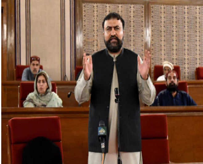
File photo: Chief Minister Balochistan, Mir Sarfaraz Bugti speaking during the assembly session