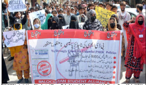
QUETTA: Activities of Students Alliance Balochistan hold protest outside Quetta Press Club (QPC).

In September 2009, two Rafale aircraft went down as they flew back to the aircraft carrier Charles de Gaulle off the coast of Perpignan after completing a test flight. One pilot died. France has sold the Rafale to Egypt, India, Greece, Indonesia, Croatia, Qatar and United Arab Emirates.