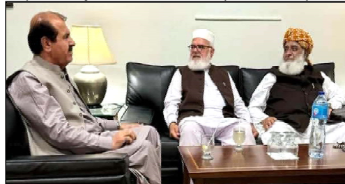
QUETTA: Justice Aurangzeb (center) with Chief Ministers Farooq Baloch and Jamshed-e-Islami secretary general Iqbal Baloch in meeting with Balochistan National Party central acting president's advocate Sajid Tareen.

The previous cabinet had been dissolved on July 10, with the election held as scheduled on August 15.