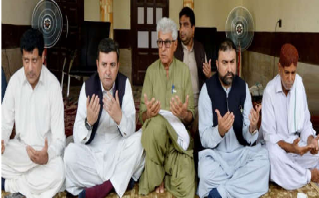
Chief Minister Balochistan, Mir Sarfaraz Bugti offering fateha for the departed soul of DC Panjgur, Zakir Baloch