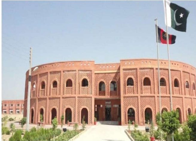
File photo of a Danish school