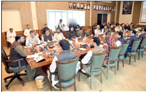
QUETTA: Balochistan Chief Minister Mir Sarfraz Bugti presiding over the provincial cabinet meeting.