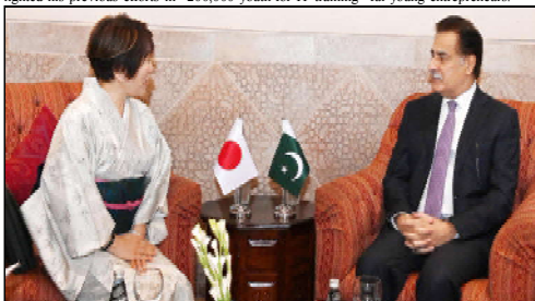
ISLAMABAD: Speaker National Assembly Sardar Ayaz Sadiq in a meeting with Minister for State of Japan Toshiko Abe.

and advanced education, he said adding that he will unveil a comprehensive development plan for the country on August 14. He stated that nothing was impossible in this world and emphasized the need to progress by learning from past mistakes. He assured that the country's hockey will be revived. Praising javelin thrower Arshad Nadeem, he noted that Nadeem had won a gold medal for the country after a drought of over 40 years. At the beginning of the event, the prime minister officially launched several key initiatives, including the Commonwealth Youth Alliance Secretariat in Islamabad, the Digital Learning Portal, the PM Green Youth Movement, and the AI for Youth Programme, which offers Intel-certified skills to young people. Other initiatives included Smart Youth, Smart Pakistan, and the distribution of one million tablets and mobile phones to high-achieving intermediate students. He also announced the registration of the National Volunteer Corps. Later, PM Shehbaz Sharif presented awards to successful young entrepreneurs.