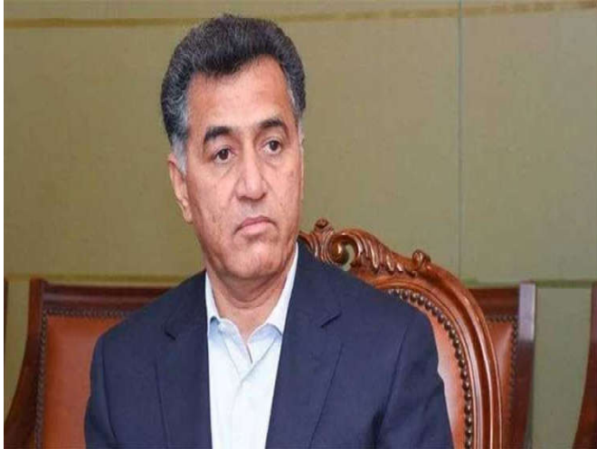
File Photo: Lt General (R) Faiz Hameed