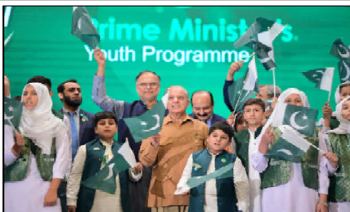
ISLAMABAD: Prime Minister Muhammad Shehbaz Sharif in a group photo with students at the International Youth Day ceremony.