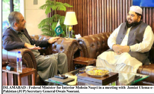
ISLAMABAD: Federal Minister for Interior Mohsin Naqvi in a meeting with Jamiat Ulama-e-Pakistan (JUP) Secretary General Owais Noorani.

said. "It's a wonderful opportunity to introduce Pakistani handicrafts to the people of Xizang. I hope this platform will not only enhance the visibility of our craftsmanship but also foster a deeper appreciation for our rich cultural heritage." With over 600 international merchants in attendance, the event fostered a vibrant atmosphere of networking and collaboration, providing a unique platform for exhibitors to showcase their products and explore new markets.