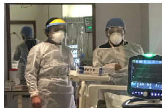
Crimean-Congo Hemorrhagic Fever (CCHF).

"The Pakistan Army believes in the process of self-accountability, and the process of self-accountability that the army follows is extremely comprehensive, transparent, and time-tested," DG Chaudhry said.