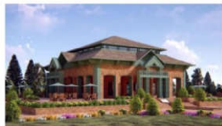
Construction of Cafeteria at Bahro-e-Ziarat