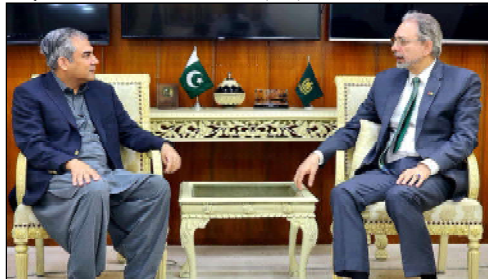
ISLAMABAD: The outgoing Ambassador of Türkiye to Pakistan, Mehmet Pacaci called on Federal Minister Interior Molsin Naqvi.

The United States (US) remained the top export destination, where Pakistan exported products worth US$183.303 million during the month under review against the exports of US$151.554 million, SBP data revealed.