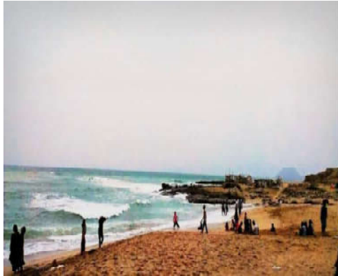
The Government of Balochistan has officially designated Charna Island as the country's second Marine Protected Area (MPA).

Balochistan previously declared Astola Island as the first Marine Protected Area in June 2017. Charna Island, located near Haft Talar (Astola Island), continues this legacy of marine conservation.