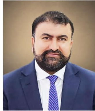
Mir Sarfaraz Bugti Chief Minister Balochistan

"As Project Director, I am honored to lead the Ziarat Development Plan, which combines ecological preservation with community empowerment. Our focus is on developing eco-friendly tourism and creating sustainable livelihoods for the local population. This project is not just about protecting the juniper forests; it's about ensuring that Ziarat's rich natural heritage benefits the people who call it home. We are working tirelessly to make this vision a reality."