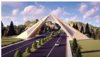
Master Planning & Development of Ziarat Town