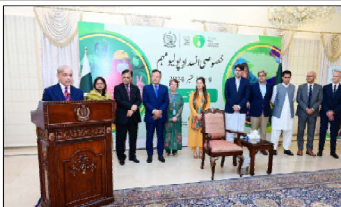
ISLAMABAD: Prime Minister Muhammad Shehbaz Sharif addressing the inaugural ceremony of nationwide Special Anti Polio Campaign.