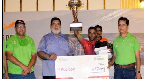
HYDERABAD: Winner of Karachi to Hyderabad Cycle race organized by Sui Southern Gas Company in connection with Defense Day celebrations receiving his prize.