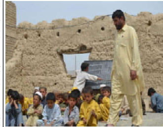
File Photo of a shelterless school in Balochistan's Killa Abdullah district

The provincial education authorities have yet to announce a comprehensive plan to address the shortage of teachers or reopen the affected schools.