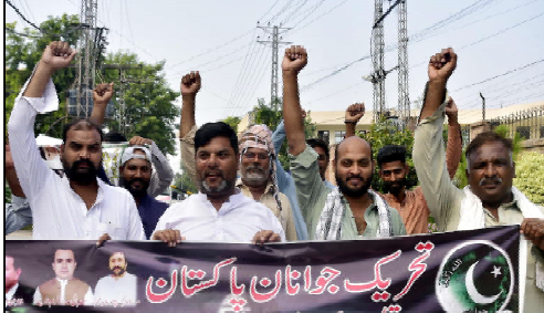
PESHAWAR: Activists of Tehreek-e-Jawan Pakistan-Minority Wing chanting slogan during a protest outside Peshawar Press Club (PPC).

As a youngster Moeen tended towards batting, but in the England shirt, he developed his bowling well enough to become their leading bowler in the Tests. He finished with 204 Test scalps, making him the third-best England spinner in the format, sitting behind Derek Underwood (297) and Graeme Swann (255).