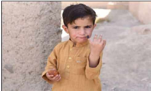
File Photo: A child raising marked finger during anti-polio campaign in Balochistan