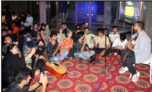
PESHAWAR: Students of a local university enjoying during Open Mic event.