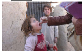
File Photo: Polio volunteers providing anti polio drops to minor girl child in Quetta, Balochistan

Shakeel Qadir Khan stressed the importance of parents ensuring their children receive polio drops, warning that failure to do so could lead to permanent disability. "It is a national problem, and we all have to play our part to solve it," he stated, emphasizing the provincial government's commitment to use all available