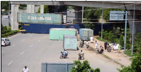
ISLAMABAD: People suffer as IJP Road block with container. The administration blocked off multiple arteries leading to the federal capital as the Pakistan Tehreek-e-Insaf (PTI) public rally at Sangiani locality.

"The suspect has not been caught at this time and we are urging people to stay inside," Trooper Scottie Pennington of the Kentucky State Police wrote on Facebook.