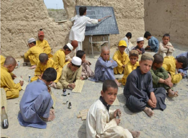
File Photo: Students at a government-run primary shelterless school in Balochistan's Killa Abdullah district