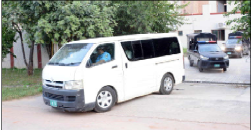
ISLAMABAD: The anti-terrorism court of Islamabad sent eight people including Pakistan Tehreek-e-Insaf (PTI) leader Advocate Shoaib Shaheen to jail on judicial remand after the verdict in the case of attack on the police.

bling events following the assault, including significant impact on her mental health. The Police Station Bugdam has assigned an Inspector-rank officer to oversee the investigation of the sensitive case. The case of Wing Commander PK Schrawat is a disturbing reminder that sexual harassment and assault continue to plague the Indian armed forces. Unfortunately, such incidents are on the rise, with numerous cases of sexual misconduct, harassment, and assault reported in recent years.