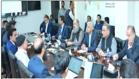
ISLAMABAD: Chairman PM Steering Committee & Federal Minister for Communications, Privatization & Board of Investment Abdul Azeem Khan presided meeting on Gens Stones.

In recent weeks, social media buzzed with calls for the restaurant to remain open, reflecting its cherished status among patrons. However, the Supreme Court's decision, upheld as final, has brought the restaurant's storied chapter to a close. The closure of Monal Restaurant signifies a significant change in the landscape of Islamabad's dining and entertainment scene, leaving many to reflect on the loss of a beloved venue.