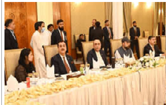
Strategy discussed to muster two-thirds majority for constitutional amendment; Fazl "skips" meeting despite president's invite.