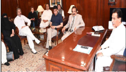
ISLAMABAD: Speaker National Assembly Ayaz Sadiq presiding over a meeting of Treasury & Opposition members in National Assembly at Parliament House.

Recalling his fond memories of Pakistani society, Congressman Al Green said that we must not allow any wedge to come between the people of Pakistan and USA.