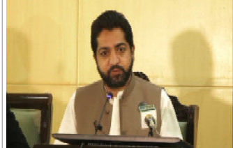
File Photo of Balochistan Home Minister Ziaullah Langove

Ziaullah Langove, a member of the Balochistan Awami Party (BAP), had won the initial election, but the tribunal ruled in favor of Saeed Langove, who alleged irregularities. The upcoming re-elections will determine the final outcome in this contested constituency. Both candidates are preparing for a heated rematch, with the eyes of the political community closely watching the developments in Kalat.