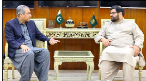
ISLAMABAD: President Awami National Party (ANP) Senator Aimal Wali Khan called on Federal Interior Minister Mohsin Naqvi.

Saif affirmed PTI's commitment to continue its struggle, declaring that the fight would persist until the release of Imran Khan, the party's founder and former Prime Minister.