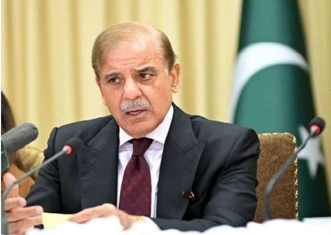
Prime Minister states that the public has rejected divisive politics and prioritised improvements in economic policies