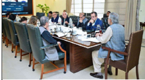
ISLAMABAD: Deputy Prime Minister and Foreign Minister Senator Muhammad Ishaq Dar chaired a meeting of the Chairpersons of newly constituted Board of Directors of the power Distribution Companies.