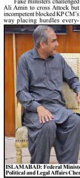
ISLAMABAD: Federal Minister for Interior Mohsin Naqvi in a meeting with Chinese Minister for Political and Legal Affairs Chen Mingguo.