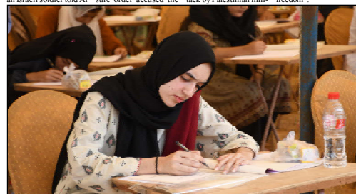
JAMSHORO: Students are solving their question papers during Pre entry test for admission in the Liaquat University of Medical & Health Sciences (LUHMS).

"Targeting journalists is this way always aims to erase the truth and prevent people from hearing the truth," the bureau chief said. Israel's army did not immediately respond to a request for comment. Benjamin Netanyahu's government has had a long-running feud with Al Jazeera that has worsened since the Gaza war began following the October 7 attack by Palestinian militant group Hamas. The Israeli military has repeatedly accused journalists from the Qatari network of being "terrorist agents" in Gaza affiliated with Hamas or its ally, Islamic Jihad. Al Jazeera denies Israel's accusations and says that Israel systematically targets its employees in the Gaza Strip. The media office of the Hamas-run government in Gaza condemned Sunday's raid, saying in a statement it was a "reounding scandal and a blatant violation of press freedom."