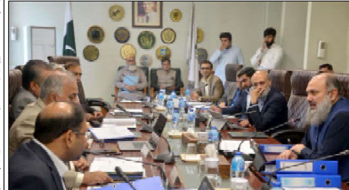
ISLAMABAD: Commerce Minister Jam Kamal Khan chairs the 85th EDF Board meeting, approving Rs. 8.5 billion for initiatives aimed at boosting Pakistan's textile, agriculture and global branding efforts.

Read More: Power utilities to collect hiked electricity charges from Sept to Nov