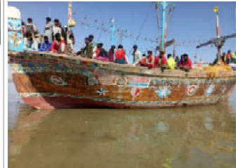
File photo: Fisheries department seized four illegal trawlers in Gwadar: Photo provided by fisheries department Balochistan

This initiative is expected to bring long-term benefits to the coastal population of Balochistan, providing them with the expertise needed to optimize resources and contribute to the region's economic development.