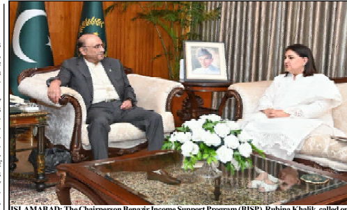
ISLAMABAD: The Chairperson Benazir Income Support Program (BISP), Rubina Khalik, called on the President Asif Ali Zardari, at Aiwan-e-Sadr.

Since the first CAEXPO, China-ASEAN economic and trade cooperation has been upgraded continuously. In the first half of 2024, the total trade value between China and ASEAN reached 3.36 trillion yuan, an increase of 10.5%. Over the same period, China's total import and export value with Belt and Road countries reached 10.03 trillion yuan, up by 7.2%.