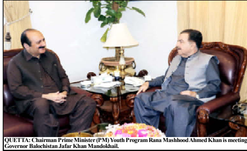
QUETTA: Chairman Prime Minister (PM) Youth Program Rana Mashhood Ahmed Khan is meeting Governor Balochistan Jafar Khan Mandokhail.

As per the new amendment, officers must be of at least inspector rank to conduct searches and arrests. Authorised officers can arrest individuals suspected of committing offenses under the Act. The law also regulates substances such as ice, meth, crystal, ecstasy, and molly.