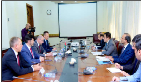
ISLAMABAD: Belarusian delegation headed by Minister for Energy Aleksei Kushnarenko is meeting with the delegation of Minister of Economic Affairs under the leadership of Minister Ahmad Cheema.

Thousands of people went berserk on May 9, 2023 after hearing the news of the arrest of their leader Imran Khan from a court in Islamabad by the Pakistan Rangers personnel.