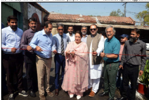
RAWALPINDI: Coordinator to Prime Minister on Climate Change, Romina Khurshid Alam inaugurating a solar energy project of a beverage company.

Hafiz Naem also condemned Israel's recent attacks on Lebanon, dedicating a week in solidarity with the people of Gaza, Palestine, and Lebanon, paying tribute to their resistance against aggression.