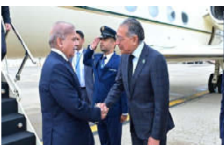
Prime Minister Shehbaz Sharif arriving in New York.