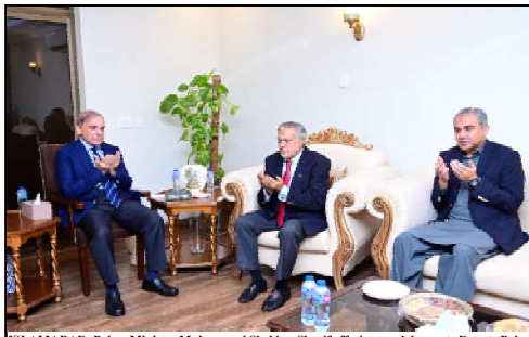
ISLAMABAD: Prime Minister Muhammad Shehbaz Sharif offering condolences to Deputy Prime Minister and Foreign Minister Ishaq Dar on the demise of his elder brother.