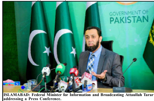
ISLAMABAD: Federal Minister for Information and Broadcasting Attaullah Tarar addressing a Press Conference.

The members also thanked Pakistan Army for organizing 4th Inter-Department National Elite Men/Women Boxing Championship 2024 at Abbottabad in a befitting manner.