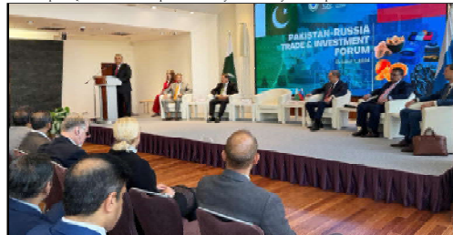
MOSCOW: Federal Minister for Board of Investment, Privatization & Communications, Abdul Aleem Khan addressing Pakistan-Russia Trade & Investment Forum.

He said that health card services would be extended to all hospitals in the province soon, people should take full advantage of the facility of health card and in case of any complaint, register their complaint on the health card helpline.