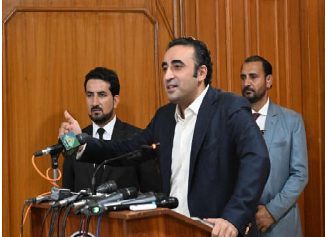
Pakistan People's Party (PPP) Chairman Bilawal Bhutto Zardari, in his address to the Balochistan High Court Bar Association