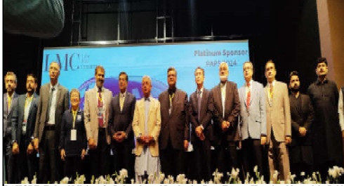
LAHORE: Federal Minister for Industries and Production Rana Tanveer Hussain addressed the Pakistan Auto Parts Show (PAPS) 2024, organised by the Pakistan Association of Automotive Parts and Accessories Manufacturers (PAAPAM) at Expo Centre.