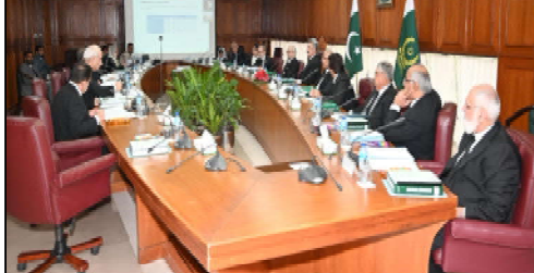
ISLAMABAD: The Hon'ble Chief Justice of Pakistan Justice Yahya Afridi presides over Full Court meeting at Supreme Court of Pakistan.

Australia squad for T20I series against Pakistan: S e a n Abbott, Xavier Bartlett, Cooper Connolly, Tim David, Nathan Ellis, Jake Fraser-McGurk, Aaron Hardie, Josh Inglis, Spencer Johnson, Glenn Maxwell, Matthew Wade, Marcus Stoinis, Adam Zampa.