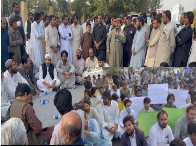
BNP Awami Chief Asad Baloch addressing a protest demonstration outside the Balochistan Assembly