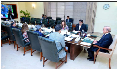
ISLAMABAD: Prime Minister Muhammad Shehbaz Sharif chairs a meeting on Polio Eradication.