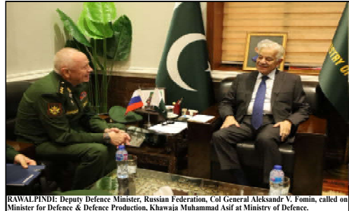
ISLAMABAD: Deputy Defence Minister, Russian Federation, Gen General Aleksandr V. Fomin, called on Minister for Defence & Defence Production, Khawaja Muhammad Asif at Ministry of Defence.

house. "Their meat and skin will be further processed keeping in view international standards and later be exported to China," he added. As per the fresh data, the population of donkeys in Pakistan has jumped to 5.9 million during the fiscal year 2023-24. The latest figures showed that the donkey population has been increasing steadily during the past few years as there were 5.5 million of them in 2019-2020, 5.6 million in 2020-21, 5.7 million in 2021-22, and 5.8 million in 2022-23.