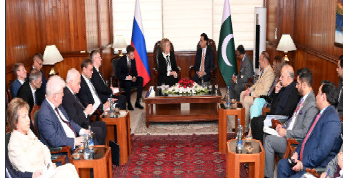
ISLAMABAD: Speaker National Assembly Sardar Ayaz Sadiq in a meeting with Parliamentary delegation headed by Speaker of the Federation Council of the Russian Federation Ms. Valentina Matvienko at Parliament House.

He concluded by asserting that the next phase of the "Haq Du" movement would mobilize citizens to reclaim their rights and hold their rulers accountable.